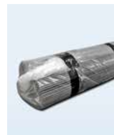
Cut to length in bulk