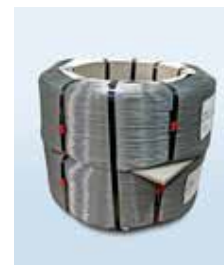
Traverse wound coil Z2