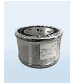
Plastic spool K355