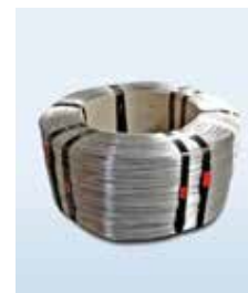
Traverse wound coil Z3