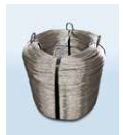
Orbit wound coil