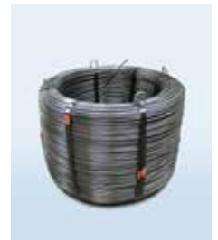
Traverse wound coil